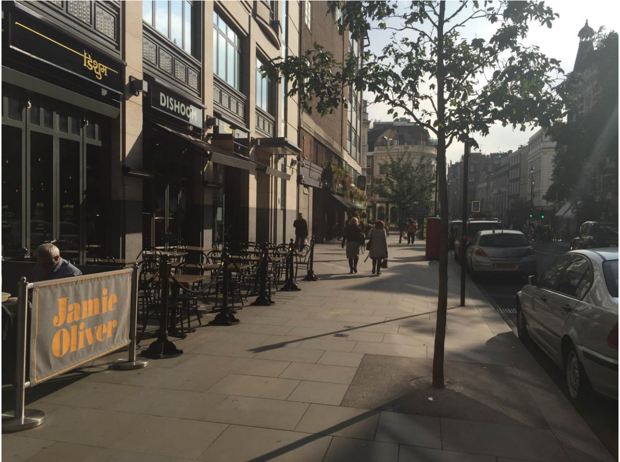
12 Upper St Martin's Lane